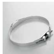
Hose Clamp with Bolts