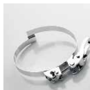
Master-Grip Quick-Grip Clamp