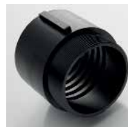
Combiflex PU Threaded Socket, screwable/fixe