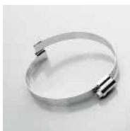
Master-Grip Hose Clamp

Depending on version and hose type, there are a wide range of connectors available: