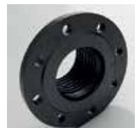
Combiflex PU Swivel Flange