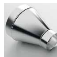
Hose Reducer, symmetrical