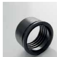
Combiflex PU Cone Flange, screwable/fixe