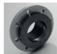
Combiflex PU Fixed Flange