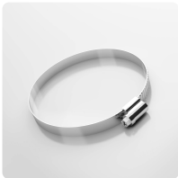
Hose Clamp with Worm-Gear Standard clamp for fastening light hose types to connecting pieces on mobile and stationary installations

After use, the product must be disposed of in accordance with the legal regulations applicable in the user’s region (in Germany in accordance with the applicable Waste Catalogue Ordinance (AVV)).