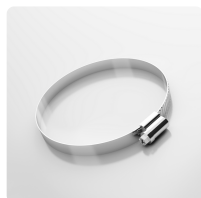
Hose Clamp with Worm-Gear Standard clamp for fastening light hose types to connecting pieces on mobile and stationary installations