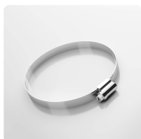
Hose Clamp with Worm-Gear, Steel quality W4, stainless steel 1.4301 Standard clamp for fastening light hose types to connecting pieces on mobile and stationary installations