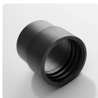
Cuff for Master-PVC-Flex special coupling for connecting Master-PVC Flex hoses