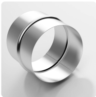
Hose connector Sheet steel connector for extending, connecting and joining light to medium-weight hoses