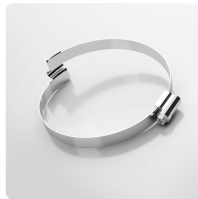
Car-Grip Hose Clamp, screwable special clamp for attaching Carflex Super and Master-PUR STEP hoses to mobile and stationary systems