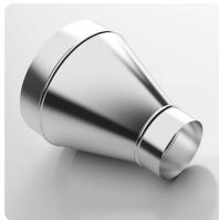
Hose Reducer, symmetrical Hose reducer for extending, connecting and joining light to medium weight hoses