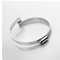
Clip-Grip Hose Clamp, screwable Screwable clamp for attaching all hose types from the Master-Clip series to mobile and stationary systems